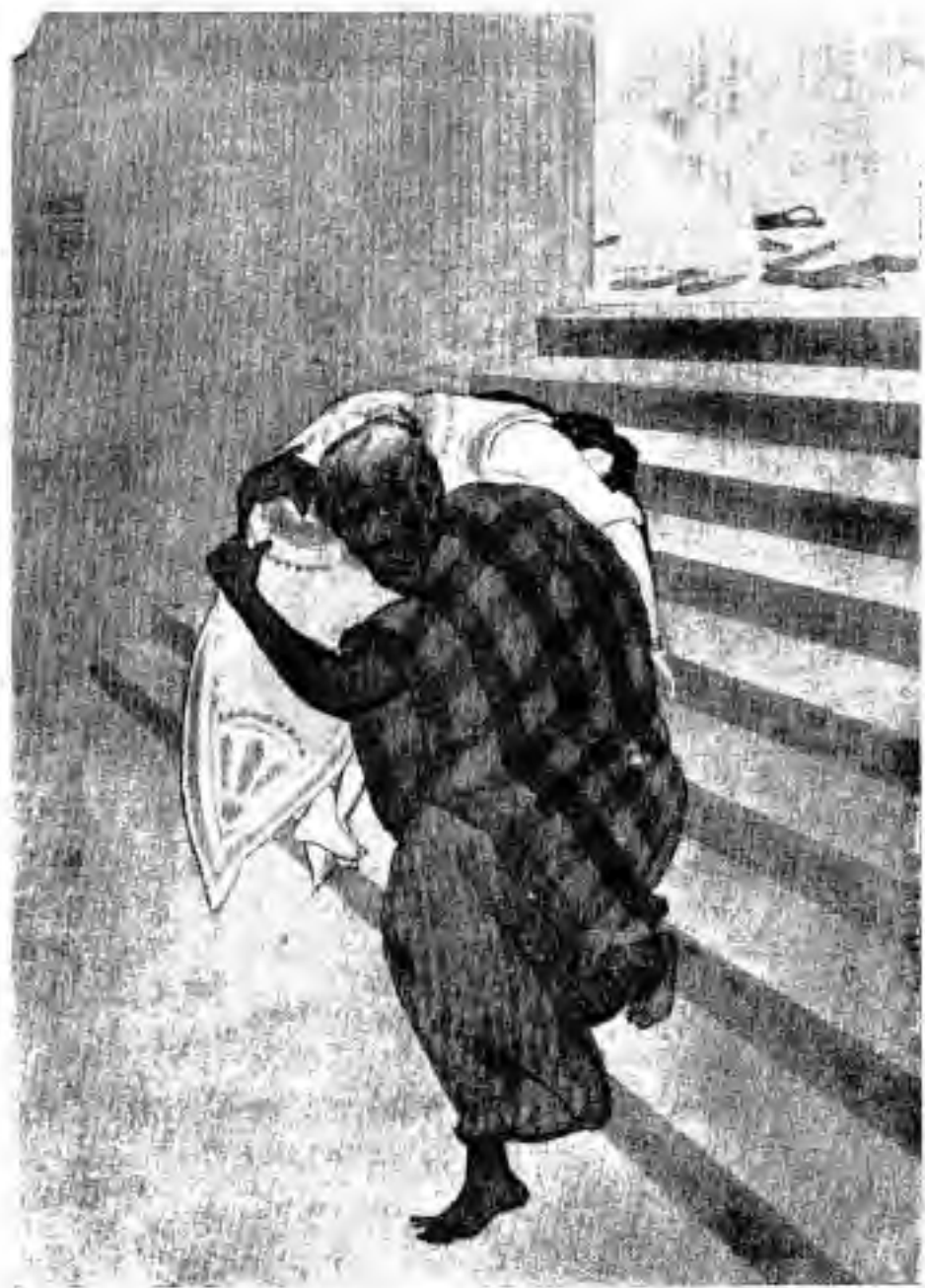
"The witch conveyed her to the Raja's son."